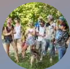
zlatna na Ostrove