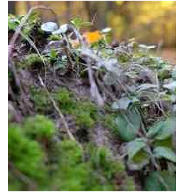
Protection of the environment