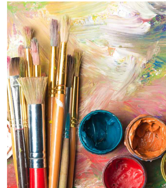
Drawing and painting